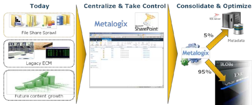
Figure 1. EMC and Metalogix help companies plan and deploy global SharePoint architectures to meet scalability, security, and efficiency needs.

The challenges for IT are clear when it comes to content explosion – centralizing and taking control of data to increase the reliability and availability of information throughout the organization. This challenge isn't as daunting when IT understands that they can extract more out of their SharePoint investments to consolidate file shares (from multiple sources) into a centralized resource to increase asset utilization, simplify management, and enhance service levels. Companies can easily maximize their investment in SharePoint as a document repository with infrastructure solutions from EMC and Metalogix (Figure 1). EMC and Metalogix solutions provide complementary products and technologies tightly integrated with SharePoint, helping businesses expand the value of their SharePoint investment with file share consolidation, automated tiered storage, flash technology, and data protection delivering immediate improvements in operational efficiencies and overall TCO.