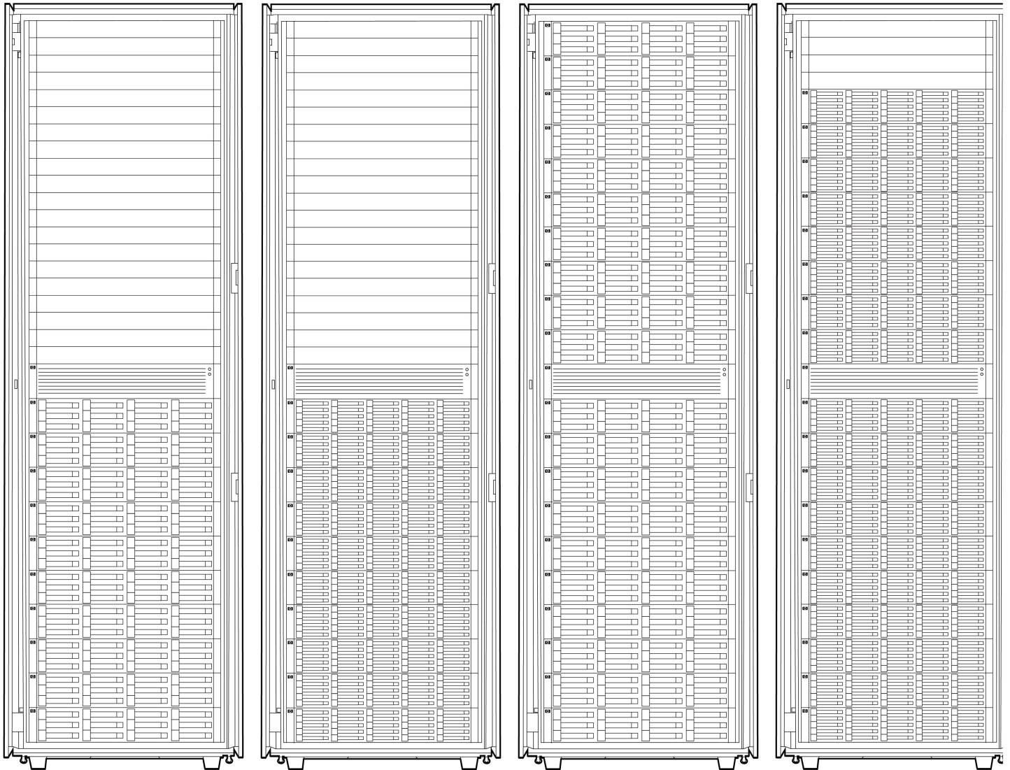
P6300 EVA 2C10D